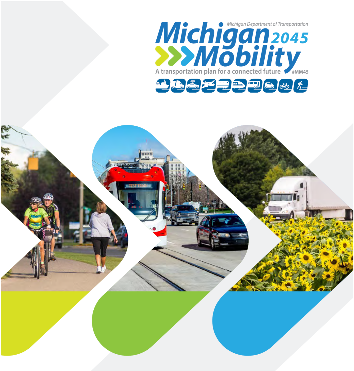
Michigan Mobility 2045 Plan